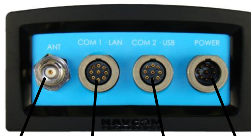
ANTENNA COM1 - LAN COM2 - USB POWER