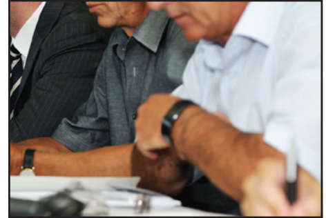
People are the most important asset in Oceaneering's project management organization

Oceaneering's project management organization draws from a global resource pool of over 20 experienced and professional Project Managers. Our Project Management team applies its industry knowledge and skill set to effectively manage subsea projects and deliver value-added solutions to our clients, on a global scale.