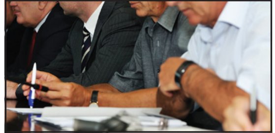
People are the most important asset in Oceaneering's project management organization

Oceaneering's project management organization draws from a global resource pool of over 20 experienced and professional Project Managers. Our Project Management team applies its industry knowledge and skill set to effectively manage subsea projects and deliver value-added solutions to our clients, on a global scale.