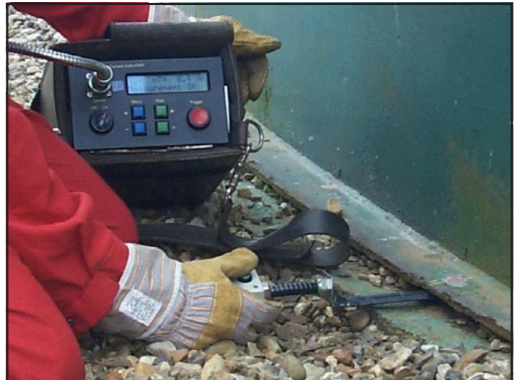
Storage Tank Inspection: Inserting PEC probe into the gap between the annular ring and tank base is a simple operation and can be performed with the tank in service.